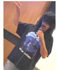
Nationals Got Talent!