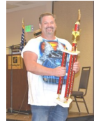
This could be you!